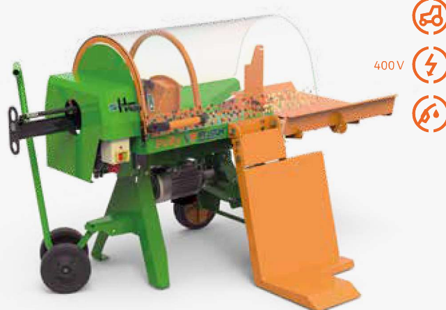
Polly E5, 5-R with 4-way-splitting knife as standard with optional lifting device