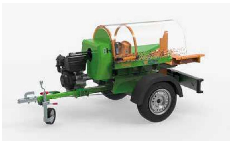
The road chassis (item no. SBL) serves to effortlessly move Polly around.

Optionally our Polly is available with a three-point linkage or PKW- tractor- chassis – for flexible deployments away from home and farm. As standard, Polly comes with manual chassis and transport aid.