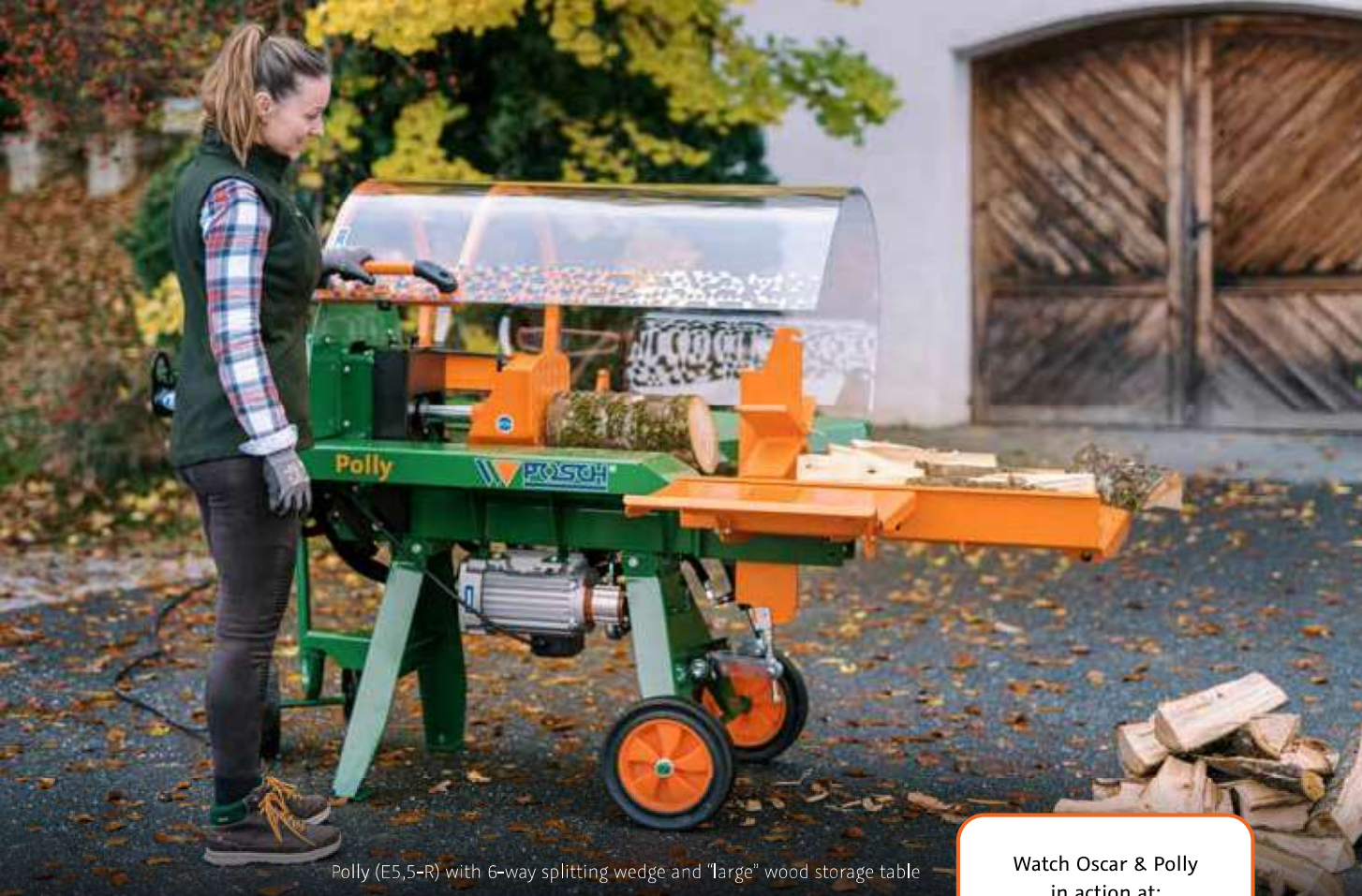
Polly (E5,5-R) with 6-way splitting wedge and "large" wood storage table

Watch Oscar & Polly in action at: www.posch.com/en/ log-splitter