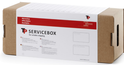
TP SERVICEBOX with critical wear parts included